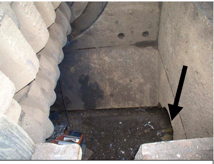
Figure 5. View into shredder box from platform outside of box showing access point from outside conveyor

The design of the shredder box met the definition of a confined space, but not the definition of а permitrequired confined space. MIOSHA adopted the provisions of 29 C.F.R. §1910.146 entitled Confined Spaces as Part 90 of the General Industry Safety Standards. 1910.146 defines a confined space as a space that: (1) Is large enough and configured that so an employee can bodily enter and perform assigned work; and (2) Has limited or restricted means for entry or exit; and (3) Is not designed