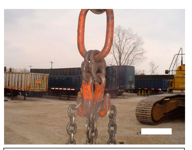
Figure 4. D Ring, chains, mobile crane

The chains and lifting configuration (D ring, steel alloy chains) are shown in Figures 3 and 4. The decedent was assigned to work in the shredder box. He accessed the shredder box via the box discharge conveyor. To remove a grate from the track, the decedent stood