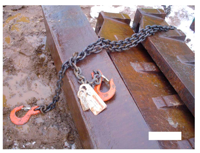
Figure 3. Lifting chains

The crew consisted of the decedent, a mobile crane operator, a coworker on top of the shredder box who assisted in signaling the crane and who helped to hook up the chains to the grates, a temporary worker who unhooked the chains after the grating was set on the ground, and a temporary worker who acted as a "gopher" to perform any other needed tasks.